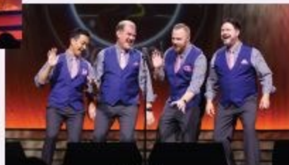
Artistic License BHS Top 10 International Quartet