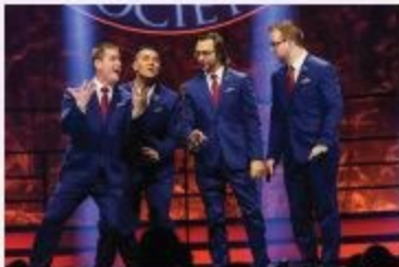
After Hours 2018 BHS International Gold Medalists