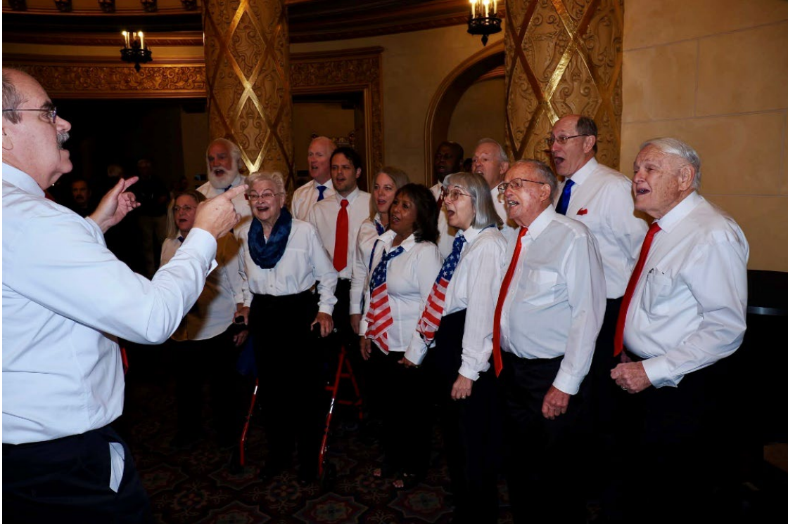
Veteran's Day Celebration at Bob Hope Theatre