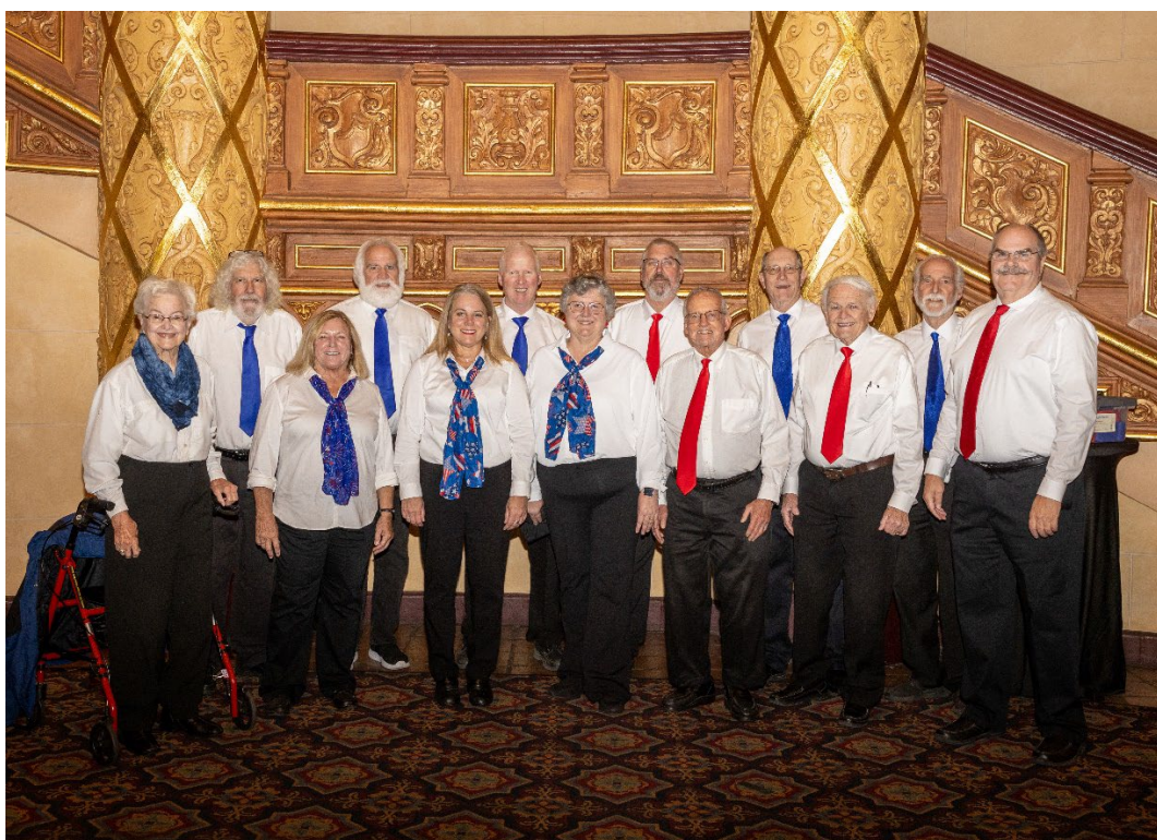
Performing in the lobby at the Bob Hope Theatre Friends of the Fox - November Classic Film PT-109