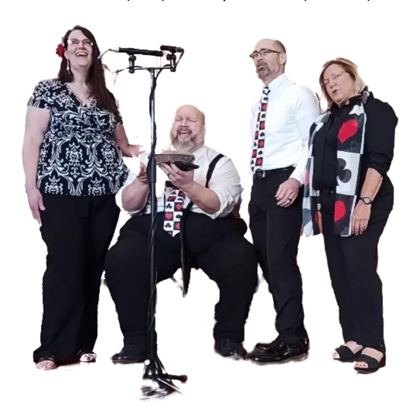
Page 8 of 18