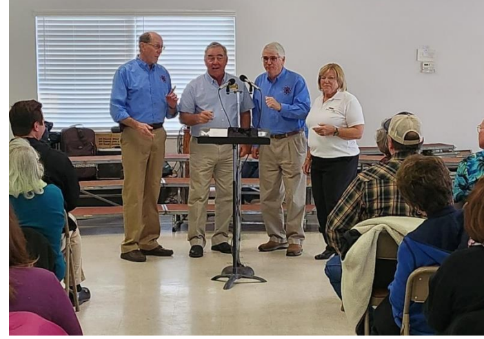
Page 7 of 12