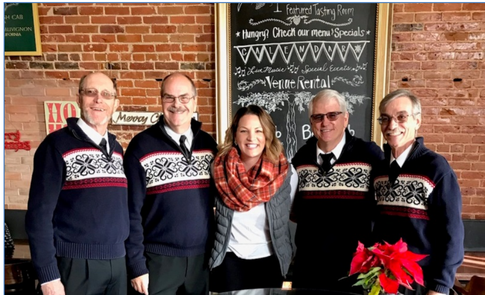
6 at Woodbridge Uncorked

We followed that up with an hours-worth of Carols and songs for the Almond Drive Christmas Party at Woodbridge County Club and then Chapter Meeting and rehearsal.