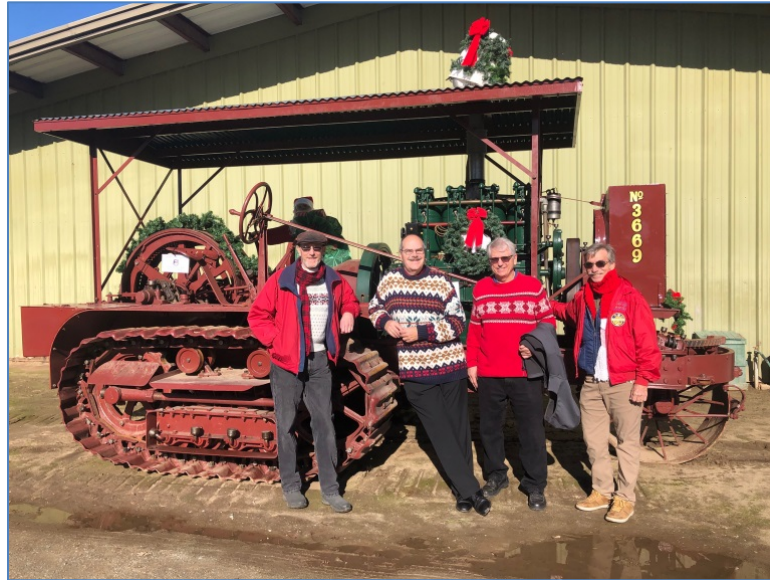
1 At the Holt

The month of December is always a busy and rewarding time for Tune Struck. While we promised our better halves to hold back this year (in July we said that would be two gigs – ha, so much for that!). We began with stepping out for a couple of songs when the Chorus sang at O’Conner Woods. Next we stepped out of the Chorus at Micke Grove for the annual visit to the Festival of Trees. One special treat was seeing the Holt tractor completed and on display.