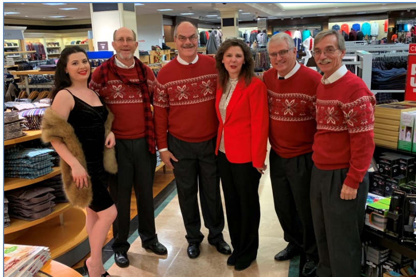
2 with the Dillard's Admins