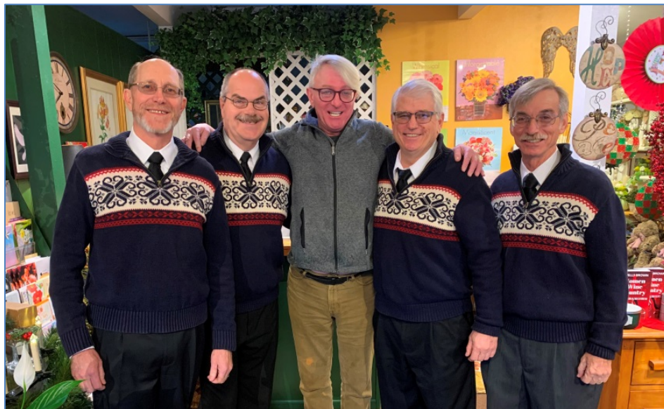
4 at the Woodbridge Florist

The next Tuesday was another busy day, starting with a 6:30 am call to help spread Holiday Cheer and awareness for the Woodbridge Wine Country Christmas on Channel 31's Good Day Sacramento. Three different segments to highlight the event the next Saturday gave us some nice exposure.