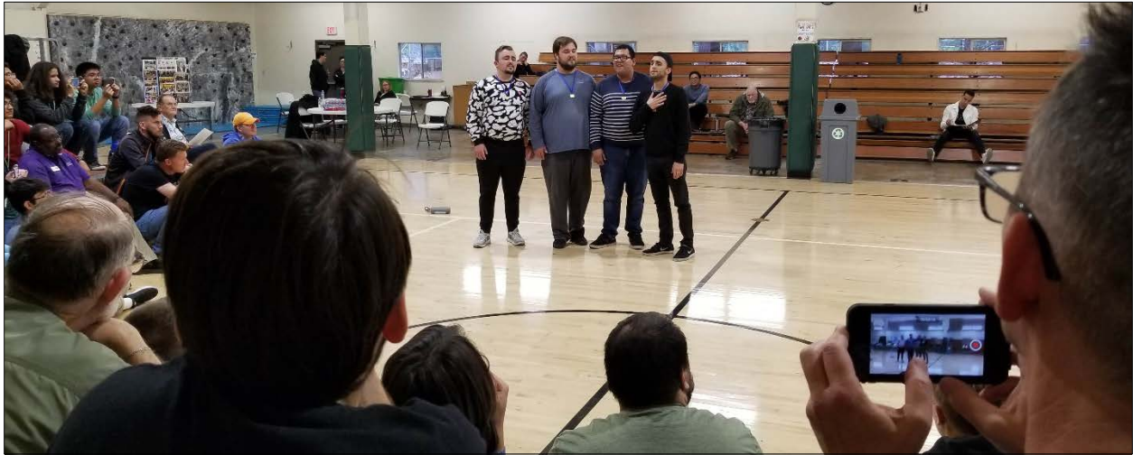
Wildfire singing for the boys

We increased our attendance from last year, welcoming 56 boys this year and as usual, the sound was amazing and their propensity for quick learning was unbelievable!! At the request of music educators we moved camp into October this year and yes it was cold Friday evening. The good news is that we discovered the cabins do have heat! Equally exciting was the addition of boys attending from five new schools. We seem to be moving from having a large number of boys from one school (10 or so) to fewer boys from each of more schools. Schools do have cycles in their programs and we see this in camp participation. Would we like to increase the number of boys attending? The answer is yes however I do believe we are increasing our base of schools and long term this will serve us well.