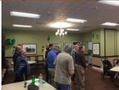
Singing for Creekside and Meadowood Rehab Centers