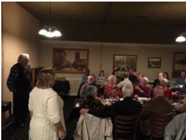
Awards & Installation Dinner