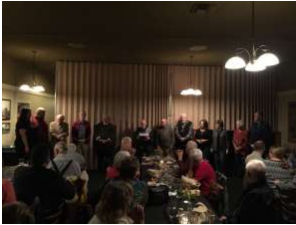
2019 Board of Directors