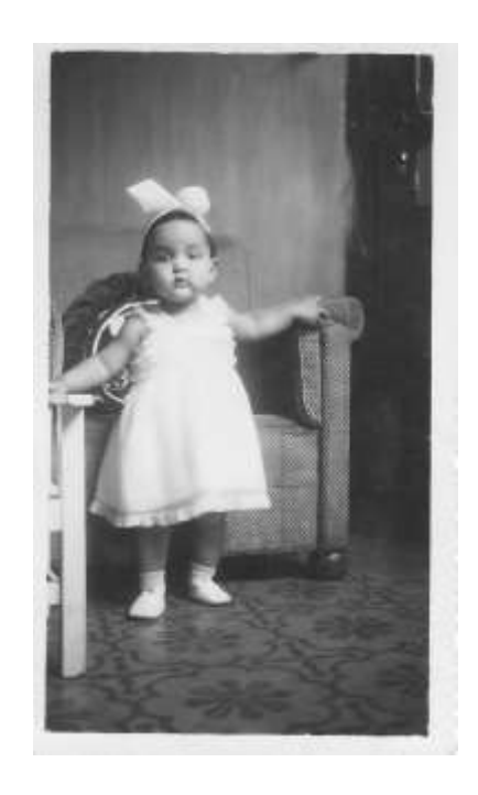
Honoring & celebrating the past, can you guess the name of this <u>former</u> Stockton Portsmen?